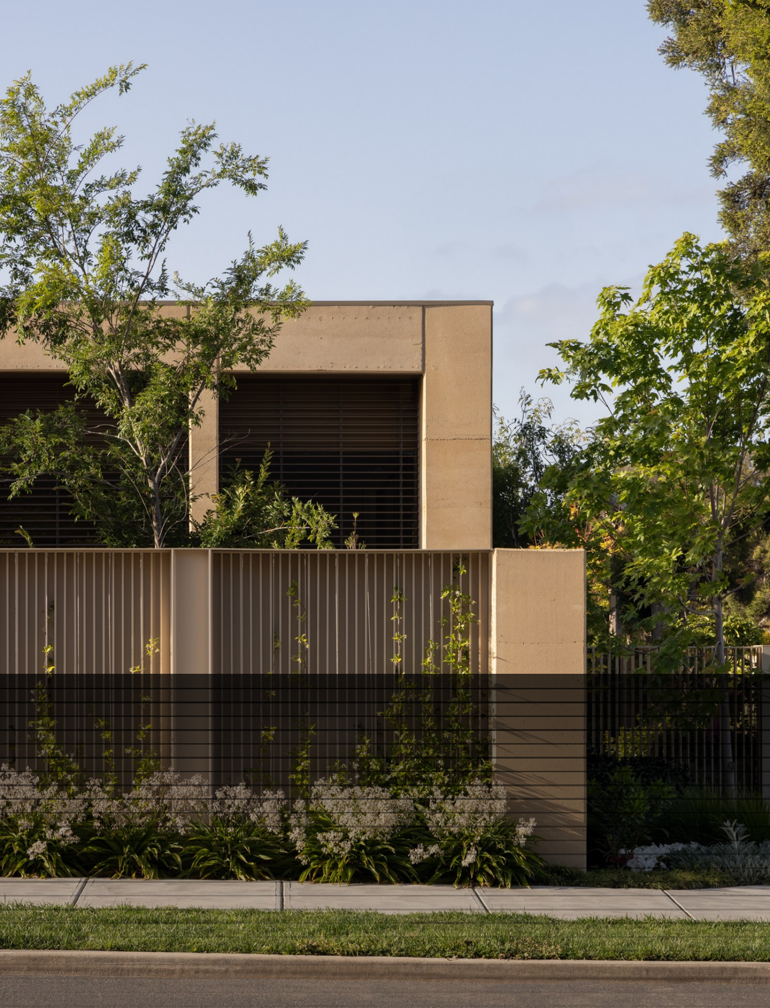
WEST ELEVATION — EVAYA EV80 EXTERNAL VENETIAN BLINDS · ST. KILDA RESIDENCE