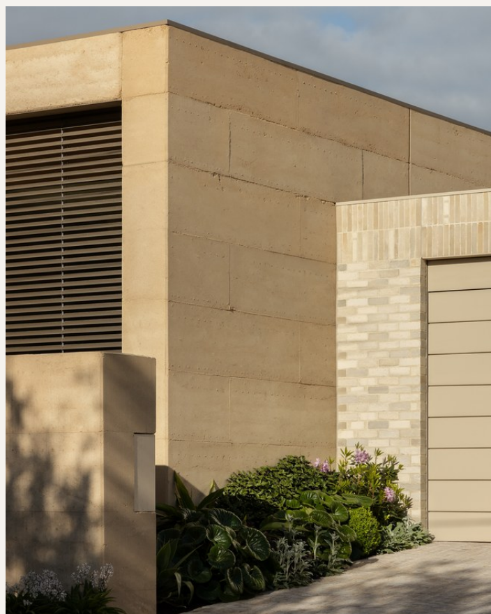
EV80 FACADE DETAIL — WIRE GUIDE & SIDE CHANNEL SYSTEMS

Max width and height for large-scale glazing