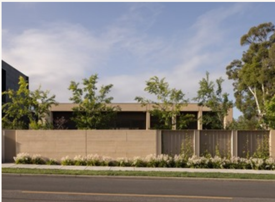
FACADE DETAIL – STONE & EV80