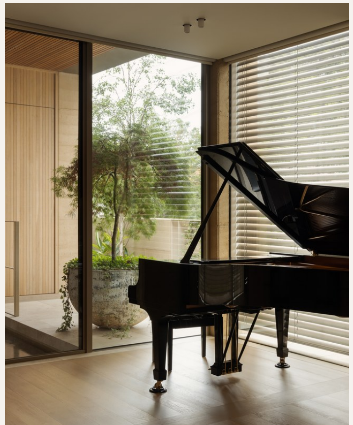
INTERIOR — PIANO ROOM WITH EV80 BLINDS